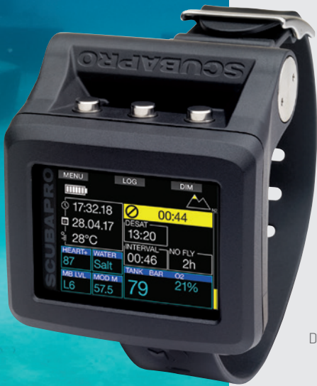
Dive Mode Screen