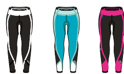
Graphite Caribbean Jewel