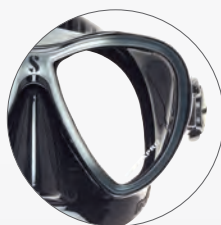
ULTRA CLEAR LENS