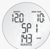
Closed Circuit Rebreathing [CCR]