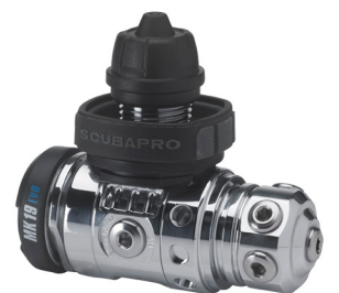
MK19 EVO DIN