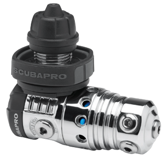
MK25 EVO DIN